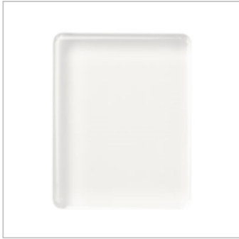
Clear Block E