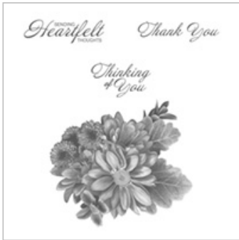
Heartfelt Blooms Clear-Mount Stamp Set