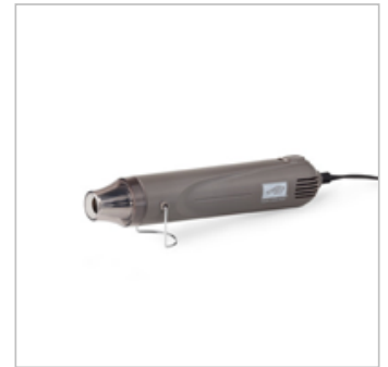
Heat Tool (Us And Canada)