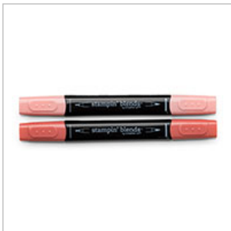
Calypso Coral Stampin' Blends Markers Combo Pack