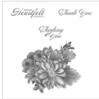
Heartfelt Blooms Wood-Mount Stamp Set