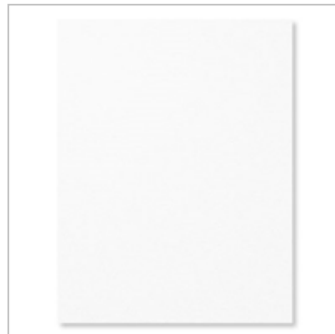
Whisper White 8-1/2\"/>