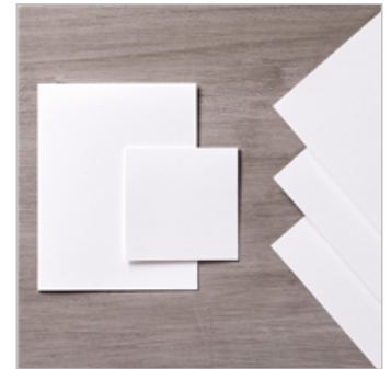
Whisper White 8-1/2\"/>