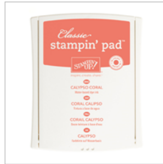
Calyпсо Coral Classic Stampin' Pad