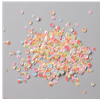
Iridescent Sequin Assortment