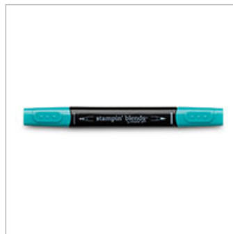
Bermuda Bay Dark Stampin' Blends Marker 144579 Price: $4.50