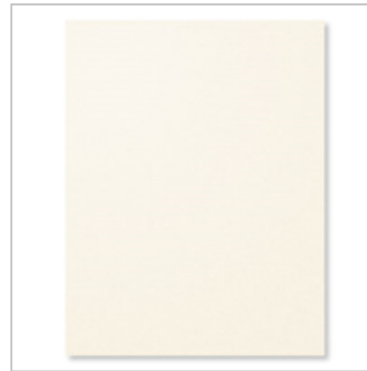
Very Vanilla 8-1/2" X 11" Cardstock 101650 Price: $9.00