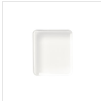
Clear Block C