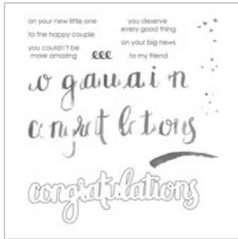
Amazing Congratulations Photopolymer Stamp Set 145938 Price: $21.00

Stesha Bloodhart Stesha@stampinhoot.com www.stampinhoot.com