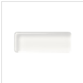
Clear Block H