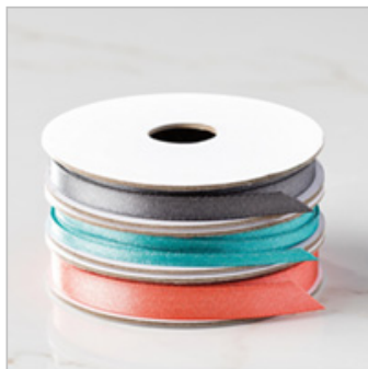
3/8" (1 Cm) Shimmer Ribbon Pack 147243 Price: $0.00