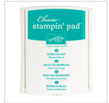
Bermuda Bay Classic Stampin' Pad 131171 Price: $6.50