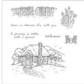
Cozy Cottage Clear-Mount Stamp Set