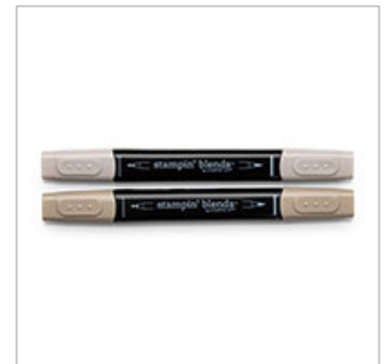
Crumb Cake Stampin' Blends Markers Combo Pack