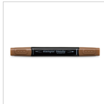
Bronze Stampin' Blends Marker