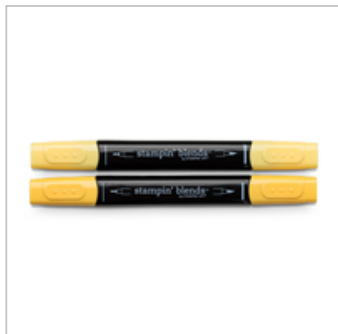
Daffodil Delight Stampin' Blends Markers Combo Pack