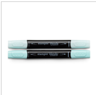
Pool Party Stampin' Blends Markers Combo Pack