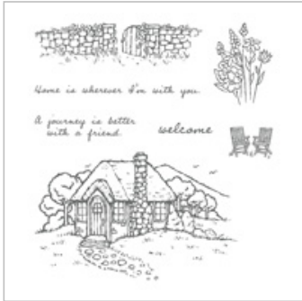
Cozy Cottage Wood-Mount Stamp Set

Stesha Bloodhart Stesha@stampinhoot.com www.stampinhoot.com