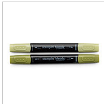
Old Olive Stampin' Blends Markers Combo Pack