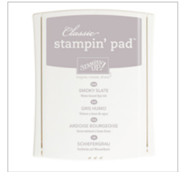
Smoky Slate Classic Stampin' Pad