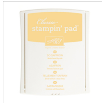
So Saffron Classic Stampin' Pad