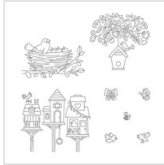
Flying Home Wood-Mount Stamp Set