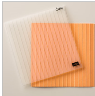
Simple Stripes Textured Impressions Embossing Folder