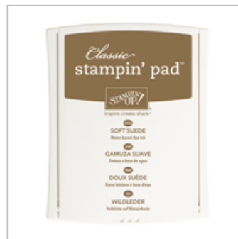
Soft Suede Classic Stampin' Pad