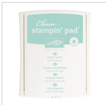
Pool Party Classic Stampin' Pad