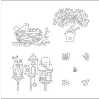
Flying Home Clear-Mount Stamp Set

Stesha Bloodhart Stesha@stampinhoot.com www.stampinhoot.com