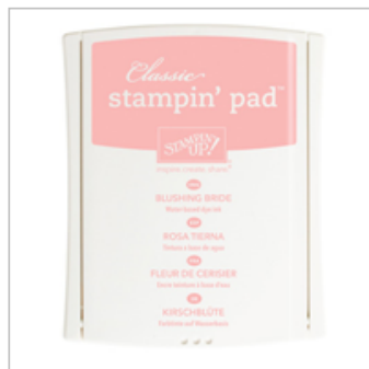
Blushing Bride Classic Stampin' Pad