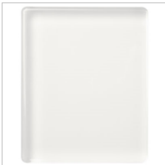
Clear Block F