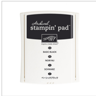
Basic Black Archival Stampin' Pad