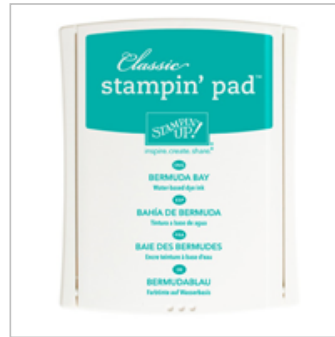
Bermuda Bay Classic Stampin' Pad