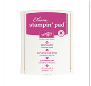
Berry Burst Classic Stampin' Pad