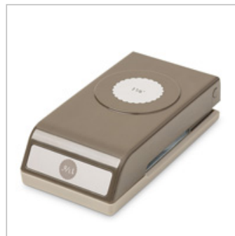
1-1/8" (2.9 Cm) Scallop Circle Punch