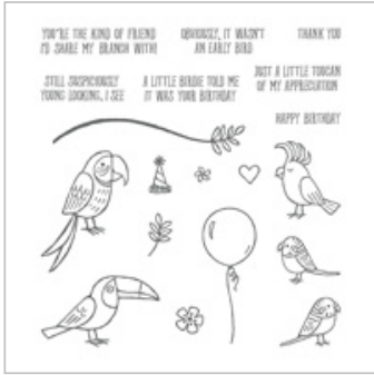
Bird Banter Photopolymer Stamp

Stesha Bloodhart Stesha@stampinhoot.com www.stampinhoot.com