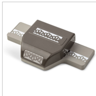
Decorative Ribbon Border Punch