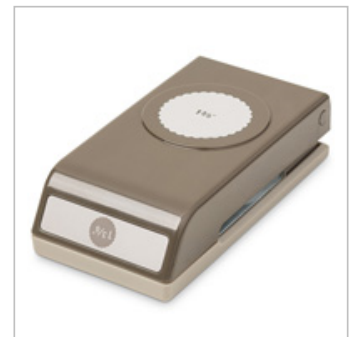
1-3/8" (3.5 Cm) Scallop Circle Punch