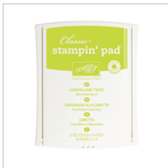
Lemon Lime Twist Classic Stampin' Pad