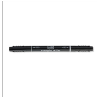
Basic Black Stampin' Write Marker