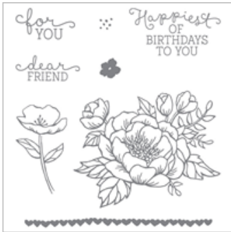
Birthday Blooms Clear-Mount Stamp Set

Stesha Bloodhart Stesha@stampinhoot.com www.stampinhoot.com