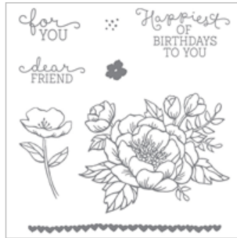
Birthday Blooms Wood-Mount Stamp Set