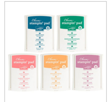
2016-2018 In Color Classic Stampin' Pads