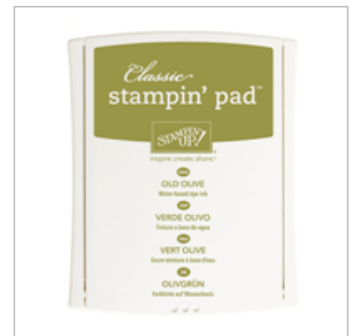
Old Olive Classic Stampin' Pad