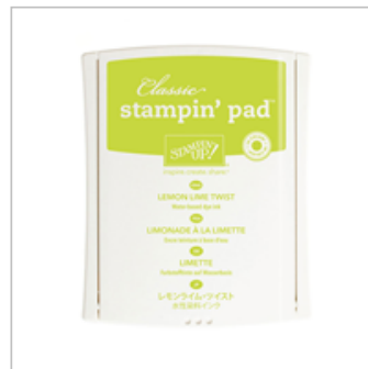
Lemon Lime Twist Classic Stampin' Pad