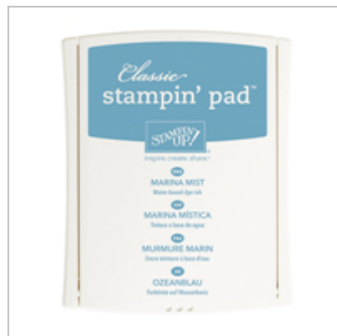
Marina Mist Classic Stampin' Pad