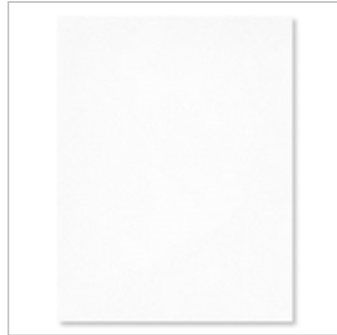
Shimmery White 8- 1/2" X 11" Cardstock