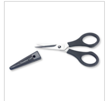
Paper Snips 103579 Price: $10.00