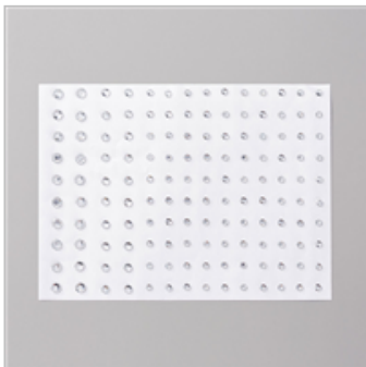
Rhinestone Basic Jewels