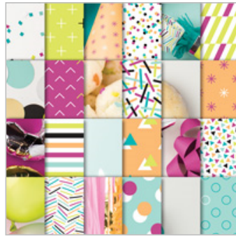
Picture Perfect Party 6" X 6" (15.2 X 15.2 Cm) Designer Series Paper 145559 Price: $10.00