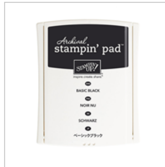
Basic Black Archival Stampin' Pad 140931 Price: $7.00