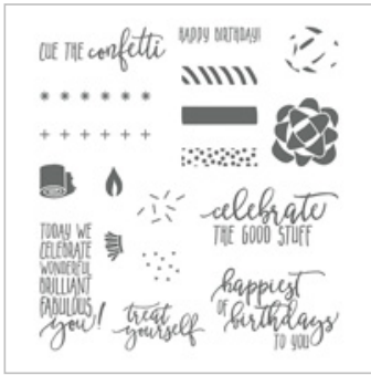
Picture Perfect Birthday Photopolymer Stamp Set 145519 Price: $17.00

Stesha Bloodhart Stesha@stampinhoot.com www.stampinhoot.com