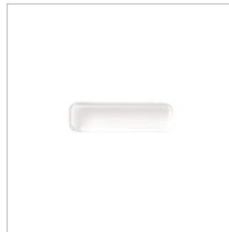
Clear Block G