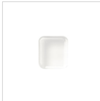
Clear Block A