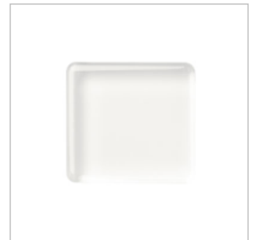
Clear Block D