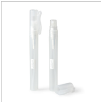
Stampin' Spritzer 126185 Price: $3.00