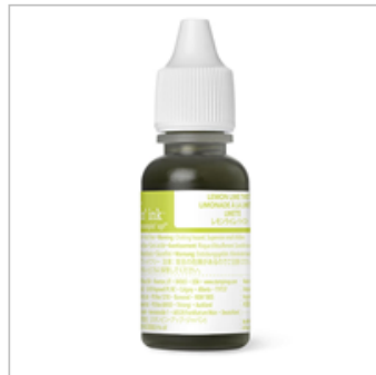
Lemon Lime Twist Classic Stampin' Ink Refill 144092 Price: $3.75