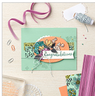
Gotta Have It All Bundle