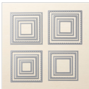
Layering Squares Framelits Dies