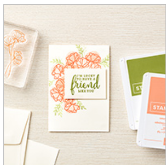
Just Getting Started Bundle