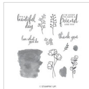
Love What You Do Photopolymer Stamp Set