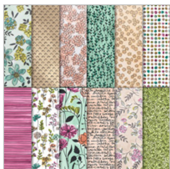
Share What You Love Specialty Designer Series Paper