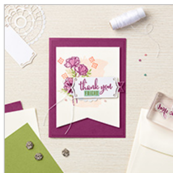
A Little More, Please Bundle