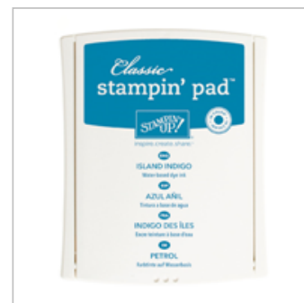
Island Indigo Classic Stampin' Pad