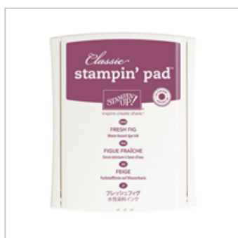
Fresh Fig Classic Stampin' Pad