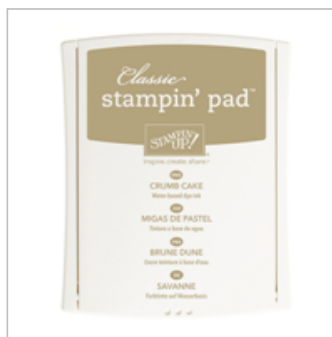
Crumb Cake Classic Stampin' Pad