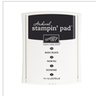
Basic Black Archival Stampin' Pad