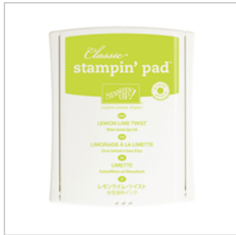
Lemon Lime Twist Classic Stampin' Pad