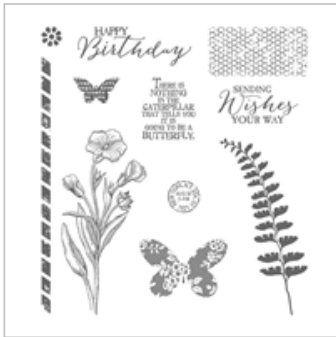
Butterfly Basics Photopolymer Stamp Set