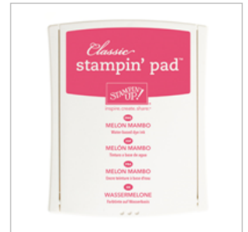
Melon Mambo Classic Stampin' Pad