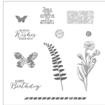
Butterfly Basics Clear-Mount Stamp Set