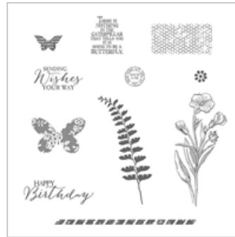
Butterfly Basics Wood-Mount Stamp Set