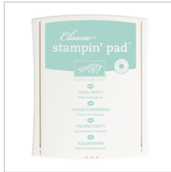
Pool Party Classic Stampin' Pad