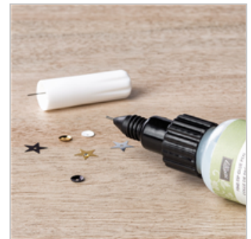
Fine-Tip Glue Pen