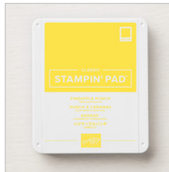
Pineapple Punch Classic Stampin' Pad