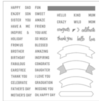
Thoughtful Banners Photopolymer Stamp Set