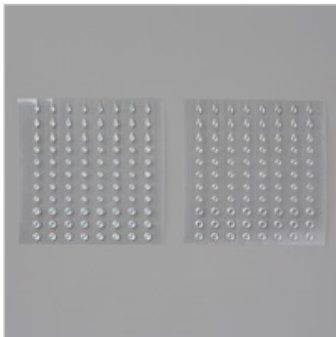
Glitter & Clear Epoxy Shapes