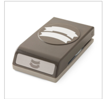
Duet Banner Punch