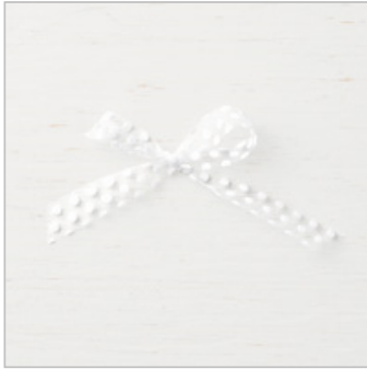
Whisper White 5/8" (1.6 Cm) Polka Dot

Stesha Bloodhart Stesha@stampinhoot.com www.stampinhoot.com