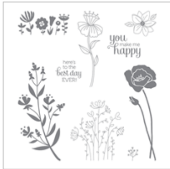
Flirty Flowers Clear-Mount Stamp Set

Stesha Bloodhart Stesha@stampinhoot.com www.stampinhoot.com