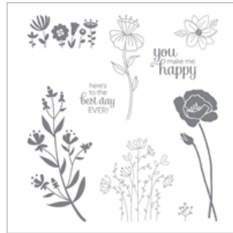
Flirty Flowers Wood-Mount Stamp Set