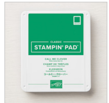
Call Me Clover Stampin' Pad