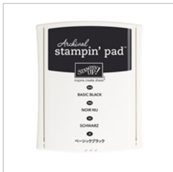
Basic Black Archival Stampin' Pad