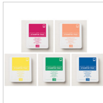
Classic Stampin' Pad Assortment In Color