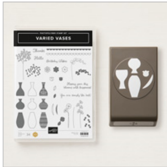
Varied Vases Photopolymer Bundle