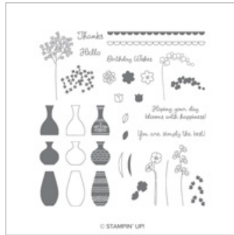
Varied Vases Photopolymer Stamp