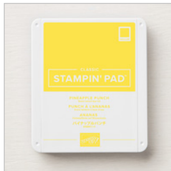
Pineapple Punch Classic Stampin' Pad