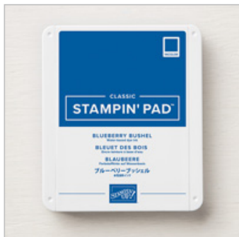
Blueberry Bushel Classic Stampin' Pad