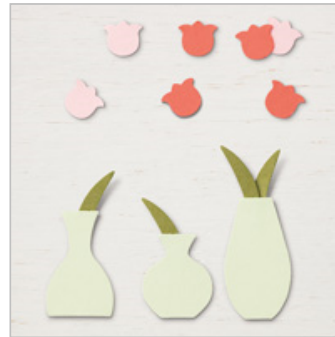
Vases Builder Punch