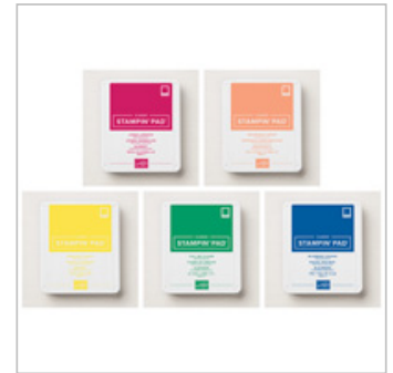
Classic Stampin' Pad Assortment In Color