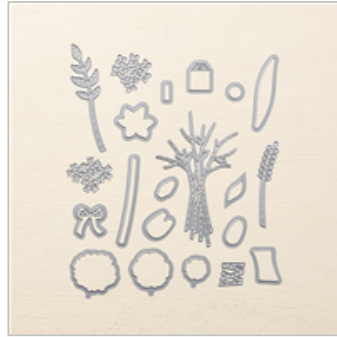
Bouquet Bunch Framelits Dies