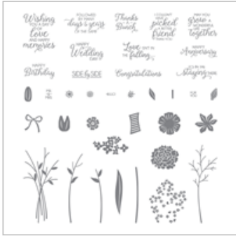
Beautiful Bouquet Photopolymer Stamp