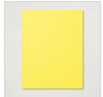
Pineapple Punch 8- 1/2" X 11" Cardstock