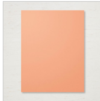
Grapefruit Grove 8- 1/2" X 11" Cardstock