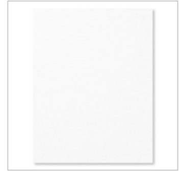
Whisper White 8-1/2" X 11" Cardstock