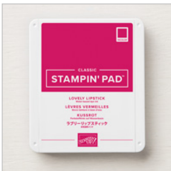
Lovely Lipstick Classic Stampin' Pad