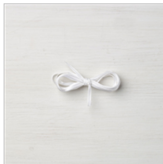
Whisper White 1/8" Sheer Ribbon