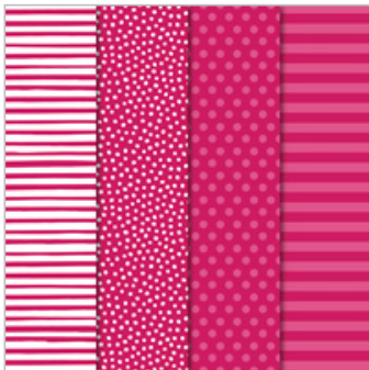
In Color 2018-2020 6" X 6" (15.2 X 15.2 Cm) Designer Series