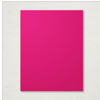
Lovely Lipstick 8-1/2" X 11" Cardstock