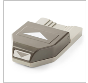
Banner Triple Punch 138292 Price: $23.00