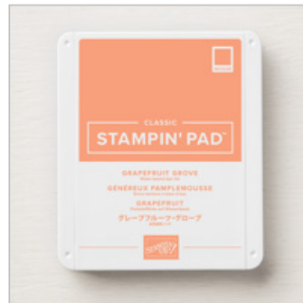
Grapefruit Grove Classic Stampin' Pad