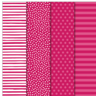
In Color 2018-2020 6\" X 6\" (15.2 X 15.2 Cm) Designer Series Paper