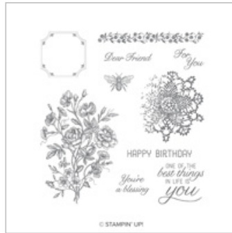
Very Vintage Wood-Mount Stamp Set