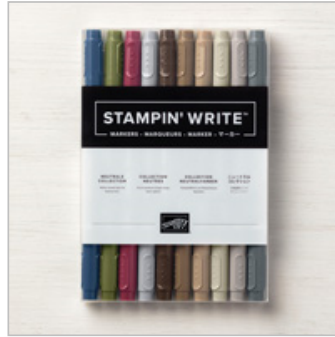
Neutrals Stampin' Write Markers 147158 Price: $30.00