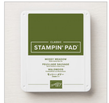
Mossy Meadow Classic Stampin' Pad