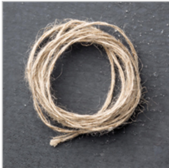
Linen Thread 104199 Price: $5.00