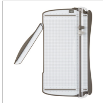
Stampin' Trimmer 126889 Price: $30.00