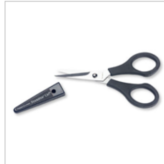
Paper Snips 103579 Price: $10.00