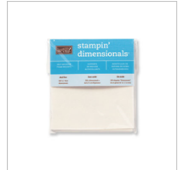
Stampin' Dimensionals 104430 Price: $4.00