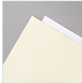
Very Vanilla 8-1/2\" X 11\" Thick Cardstock