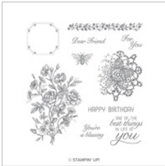
Very Vintage Clear-Mount Stamp Set

Stesha Bloodhart Stesha@stampinhoot.com www.stampinhoot.com