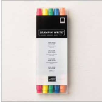
In Color 2018–2020 Stampin' Write Markers 147159 Price: $15.00

Stesha Bloodhart Stesha@stampinhoot.com www.stampinhoot.com