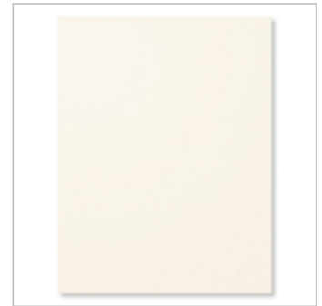
Very Vanilla 8-1/2\" X 11\" Cardstock