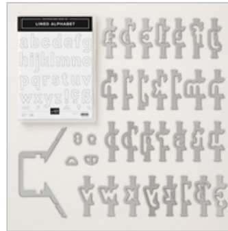
Lined Alphabet Photopolymer Bundle