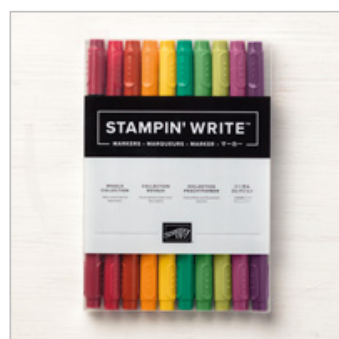
Regals Stampin' Write Markers