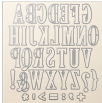
Large Letters Framelits Dies