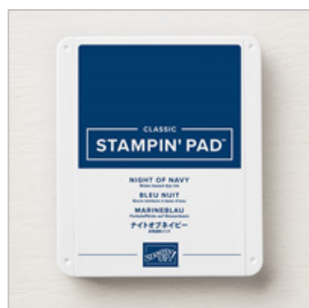
Night Of Navy Classic