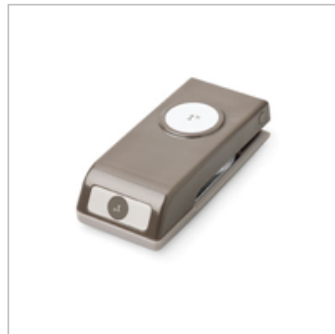
1" (2.5 Cm) Circle