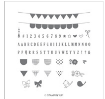
Pick A Pennant Photopolymer Stamp