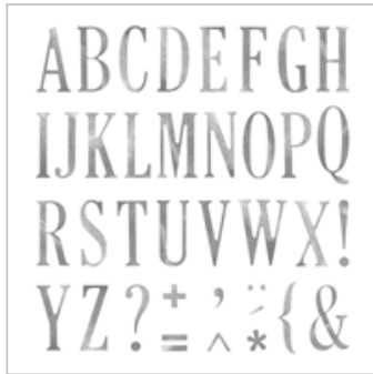
Letters For You Photopolymer Stamp