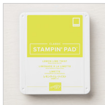
Lemon Lime Twist