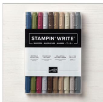
Neutrals Stampin' Write Markers