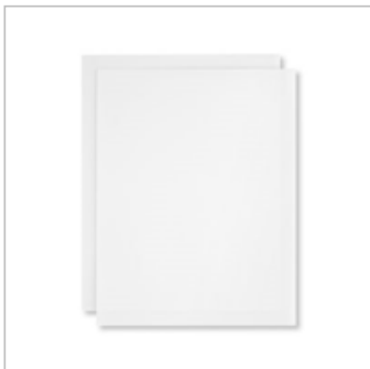
Vellum 8-1/2" X 11" Cardstock