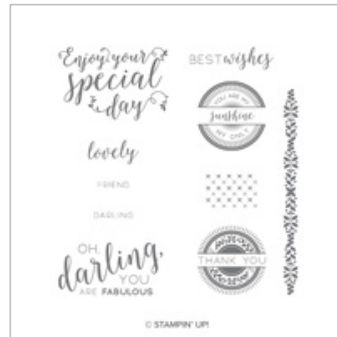
Stitched All Around Wood-Mount Stamp Set