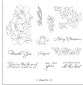
Blended Seasons Clear-Mount Stamp Set