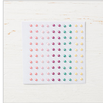
Share What You Love Artisan Pearls