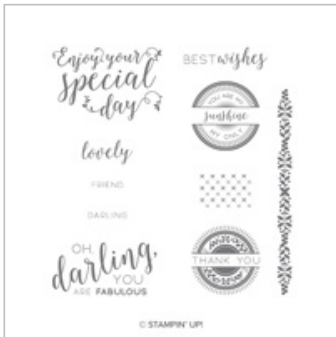
Stitched All Around Clear-Mount Stamp Set