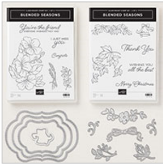
Blended Seasons Clear-Mount Bundle

Stesha Bloodhart Stesha@stampinhoot.com www.stampinhoot.com