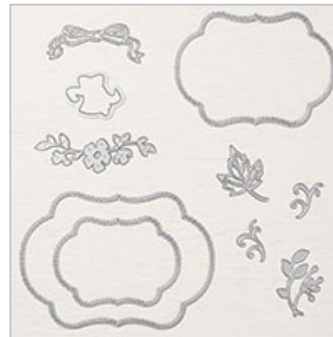
Stitched Seasons Framelits Dies