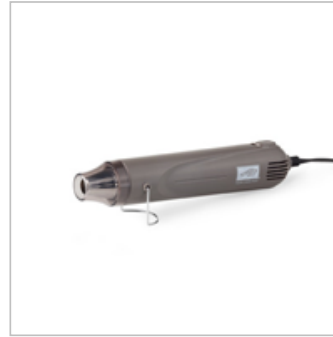
Heat Tool (Us And Canada)