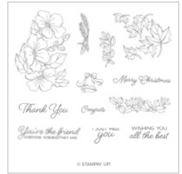
Blended Seasons Wood-Mount Stamp Set