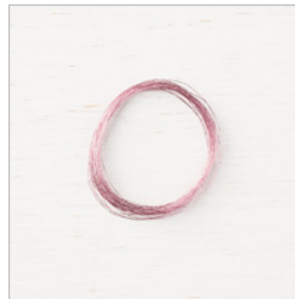
Rose Metallic Thread