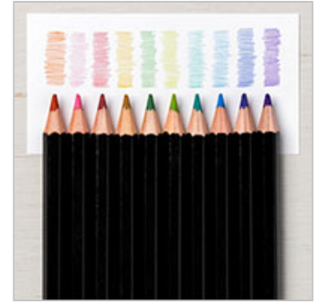
Watercolor Pencils Assortment 2