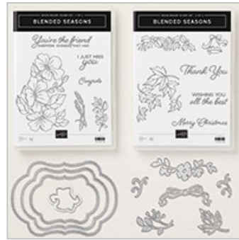
Blended Seasons Wood-Mount Bundle