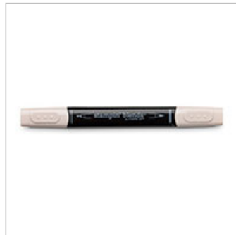
Ivory Stampin' Blends Marker