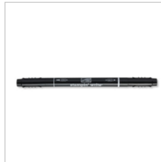
Basic Black Stampin' Write Marker