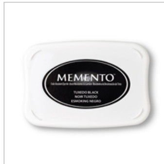
Tuxedo Black Memento Ink Pad