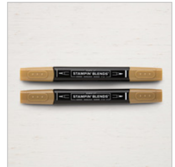
Soft Suede Stampin' Blends Markers Combo Pack