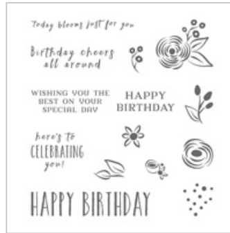
Perennial Birthday Clear-Mount Stamp Set