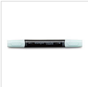
Pool Party Light Stampin' Blends Marker