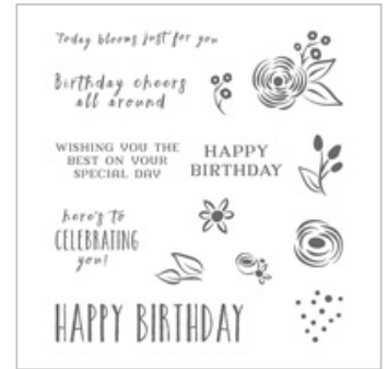
Perennial Birthday Wood-Mount Stamp Set