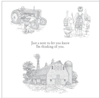
Heartland Clear-Mount Stamp Set

Stesha Bloodhart Stesha@stampinhoot.com www.stampinhoot.com