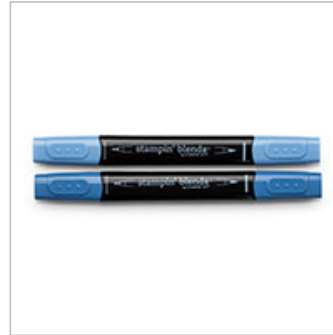
Night Of Navy Stampin' Blends Markers Combo Pack