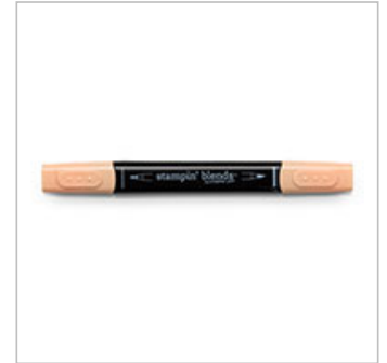
Pumpkin Pie Light Stampin' Blends Marker