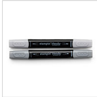
Smoky Slate Stampin' Blends Markers Combo Pack