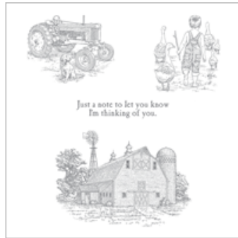
Heartland Wood-Mount Stamp Set