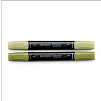
Old Olive Stampin' Blends Markers Combo Pack

Stesha Bloodhart Stesha@stampinhoot.com www.stampinhoot.com