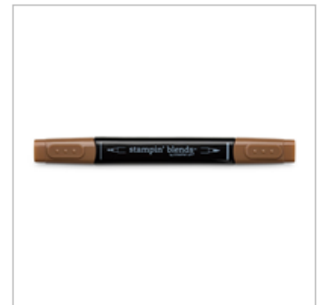
Bronze Stampin' Blends Marker