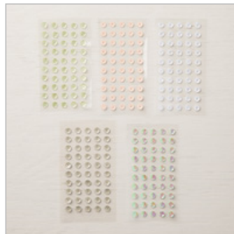
Basic Adhesive- Backed Sequins