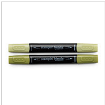
Old Olive Stampin' Blends Markers