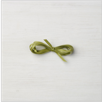
Old Olive 1/8" Sheer Ribbon

Stesha Bloodhart Stesha@stampinhoot.com www.stampinhoot.com