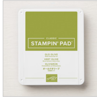
Old Olive Classic Stampin' Pad