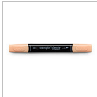
Pumpkin Pie Light Stampin' Blends Marker