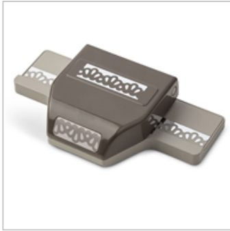
Decorative Ribbon Border Punch