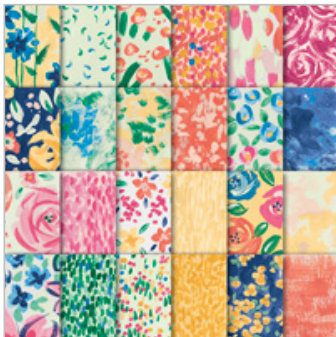
Garden Impressions 6" X 6" (15.2 X 15.2 Cm) Designer Series Paper