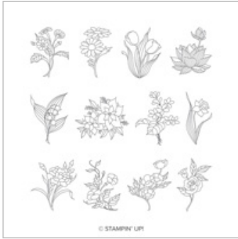
In Every Season Clear-Mount Stamp Set

Stesha Bloodhart Stesha@stampinhoot.com www.stampinhoot.com