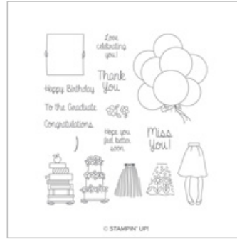
Hand Delivered Photopolymer Stamp Set