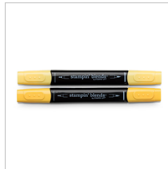
Daffodil Delight Stampin' Blends Markers