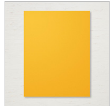
Mango Melody 8-1/2" X 11" Cardstock