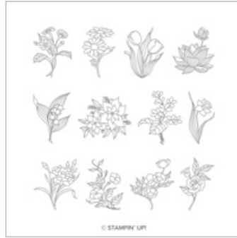
In Every Season Wood-Mount Stamp Set