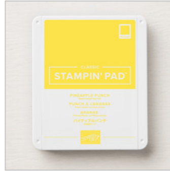
Pineapple Punch Classic Stampin' Pad