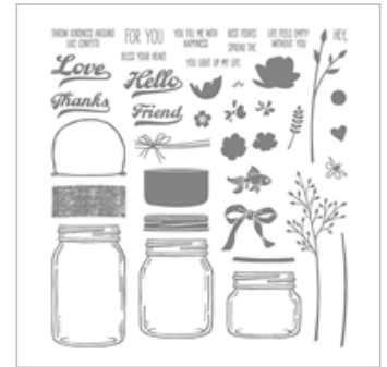
Jar Of Love Photopolymer Stamp Set