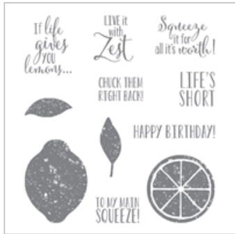
Lemon Zest Clear-Mount Stamp Set

Stesha Bloodhart Stesha@stampinhoot.com www.stampinhoot.com