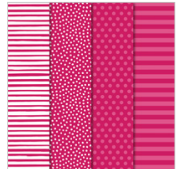
In Color 2018-2020 6" X 6" (15.2 X 15.2 Cm) Designer Series Paper