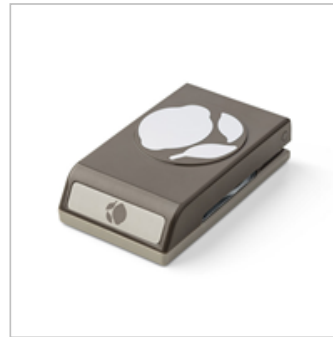
Lemon Builder Punch