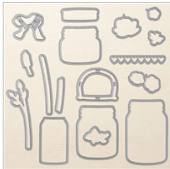
Everyday Jars Framelits Dies