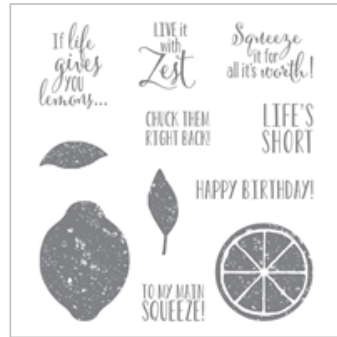
Lemon Zest Wood-Mount Stamp Set