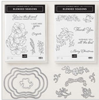
Blended Seasons Clear-Mount Bundle

Stesha Bloodhart Stesha@stampinhoot.com www.stampinhoot.com