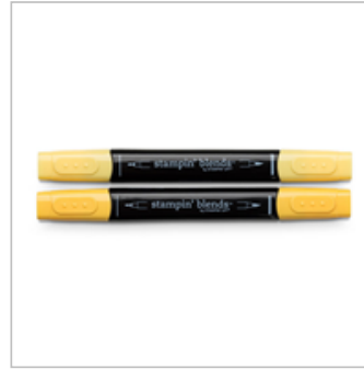
Daffodil Delight Stampin' Blends Markers Combo Pack