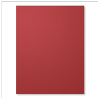
Cherry Cobbler 8-1/2" X 11" Cardstock