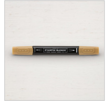
Light Soft Suede Stampin' Blends Marker