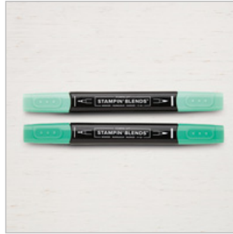
Call Me Clover Stampin' Blends Markers Combo Pack