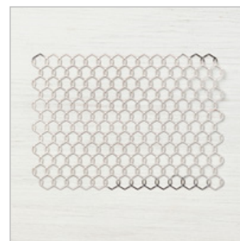
Chicken Wire Elements