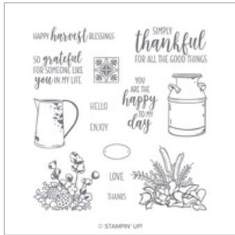
Country Home Photopolymer Stamp Set

Stesha Bloodhart Stesha@stampinhoot.com www.stampinhoot.com