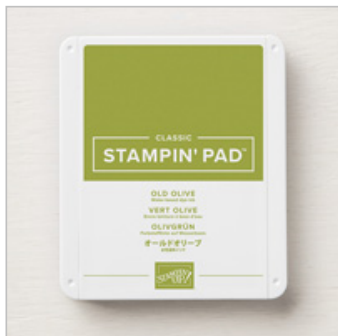
Old Olive Classic Stampin' Pad