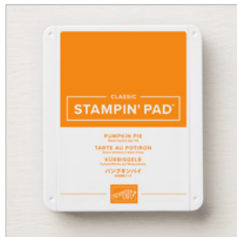
Pumpkin Pie Classic Stampin' Pad