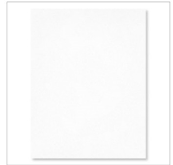
Shimmery White 8-1/2" X 11" Cardstock