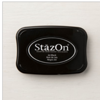
Jet Black Stzon Ink Pad