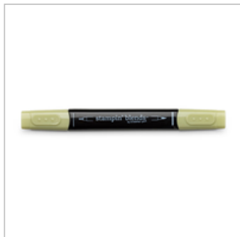
Old Olive Light Stampin' Blends Marker

Stesha Bloodhart Stesha@stampinhoot.com www.stampinhoot.com