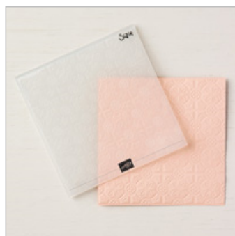
Tin Tile Dynamic Textured Impressions Embossing Folder