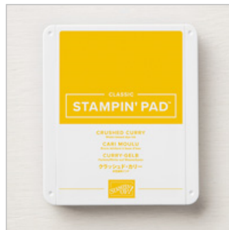
Crushed Curry Classic Stampin' Pad