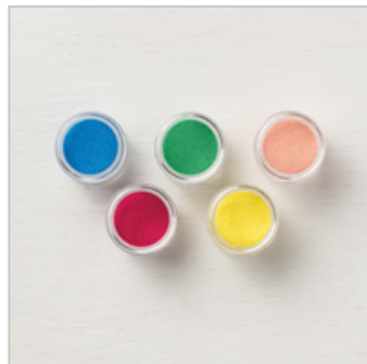
In Color 2018–2020 Stampin' Emboss Powder