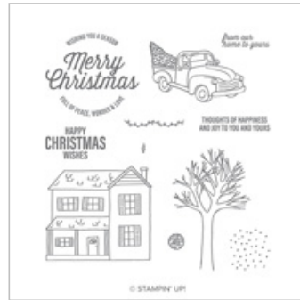
Farmhouse Christmas Photopolymer Stamp Set