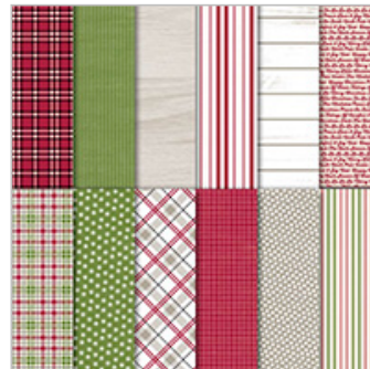
Festive Farmhouse 12" X 12" (30.5 X 30.5 Cm) Designer Series Paper