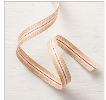
5/8" (1.6 Cm) Striped Burlap Trim