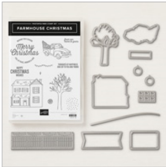
Farmhouse Christmas Photopolymer Bundle

Stesha Bloodhart Stesha@stampinhoot.com www.stampinhoot.com