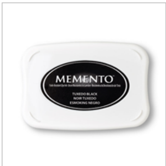
Tuxedo Black Memento Ink Pad