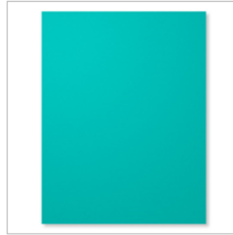
Bermuda Bay 8-1/2" X 11" Cardstock