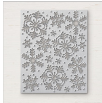
Blizzard Thinlits Die