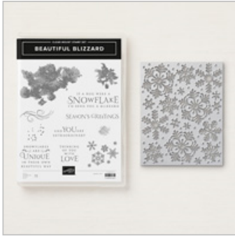
Beautiful Blizzard Clear-Mount Bundle

Stesha Bloodhart Stesha@stampinhoot.com www.stampinhoot.com