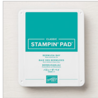
Bermuda Bay Classic Stampin' Pad