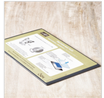
Precision Base Plate