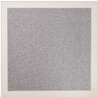
Silver Glimmer Paper