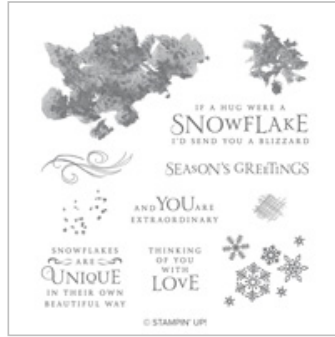
Beautiful Blizzard Clear-Mount Stamp Set