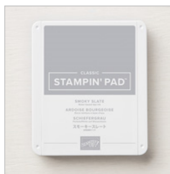
Smoky Slate Classic Stampin' Pad