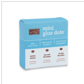
Mini Glue Dots