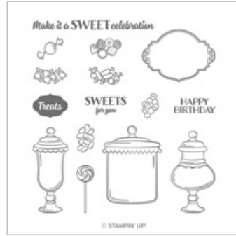
Sweetest Thing Photopolymer Stamp Set