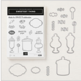
Sweetest Thing Photopolymer Bundle

Stesha Bloodhart Stesha@stampinhoot.com www.stampinhoot.com