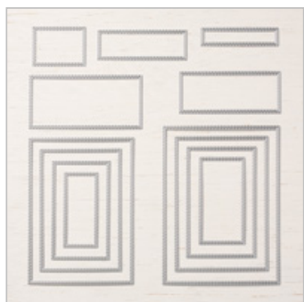
Rectangle Stitched Framelits Dies