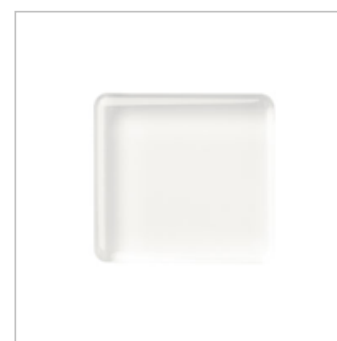
Clear Block D