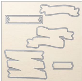
Bunch Of Banners