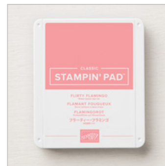
Flirty Flamingo Classic Stampin' Pad