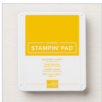
Crushed Curry Classic Stampin' Pad