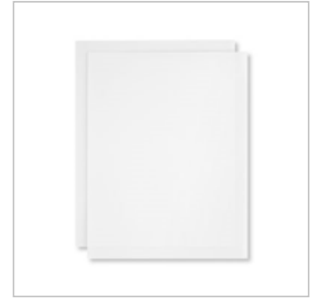
Vellum 8-1/2" X 11" Cardstock