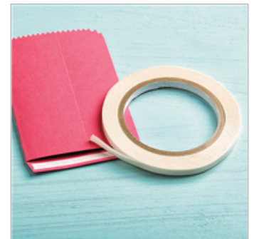
Tear & Tape Adhesive