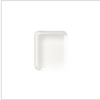
Clear Block B

Stesha Bloodhart Stesha@stampinhoot.com www.stampinhoot.com