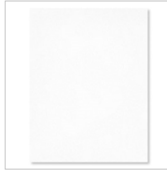
Shimmery White 8-1/2" X 11" Cardstock