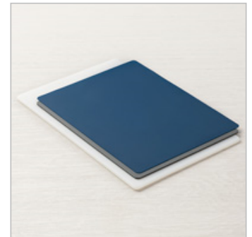
Big Shot Embossing Mats