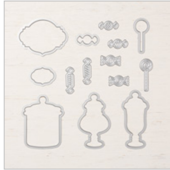
Jar Of Sweets Framelits Dies