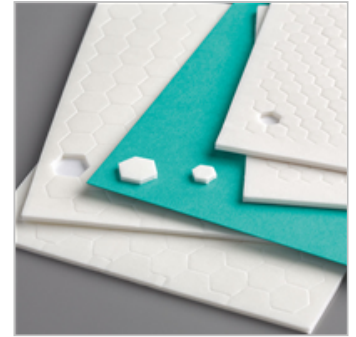
Mini Stampin' Dimensionals