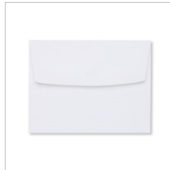
Whisper White Medium Envelopes