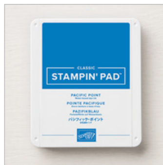
Pacific Point Classic Stampin' Pad