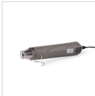
Heat Tool (Us And Canada)