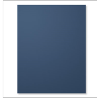
Night Of Navy 8-1/2" X 11" Cardstock