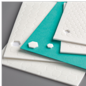
Mini Stampin' Dimensionals