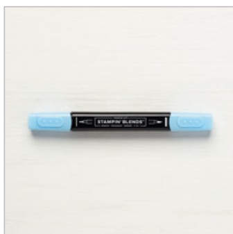
Balmy Blue Dark Stampin' Blends Marker