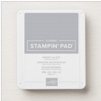
Smoky Slate Classic Stampin' Pad