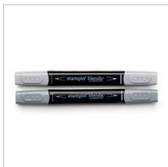
Smoky Slate Stampin' Blends Markers Combo Pack