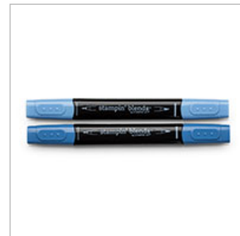
Night Of Navy Stampin' Blends Markers Combo Pack