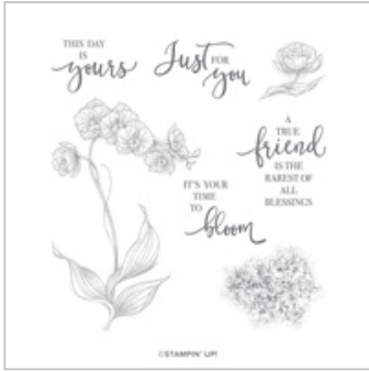
Rare Blessings Cling Stamp Set

Stesha Bloodhart Stesha@stampinhoot.com www.stampinhoot.com