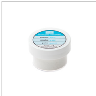
White Stampin' Emboss Powder