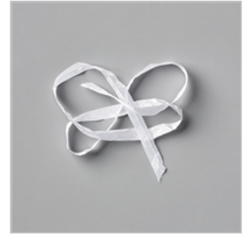
Whisper White 1/4" (6.4 Mm) Crinkled Seam Binding Ribbon