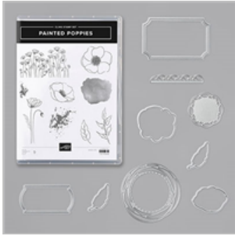
Painted Poppies Bundle