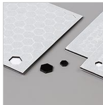
Black Stampin' Dimensionals Combo Pack