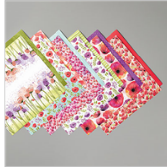
Peaceful Poppies Designer Series Paper