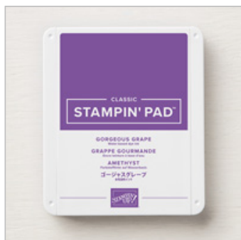
Gorgeous Grape Classic Stampin' Pad