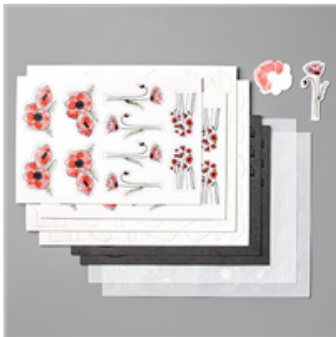
Peaceful Poppies Elements