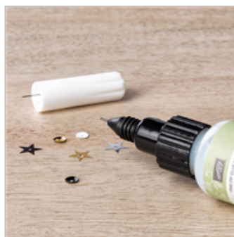
Fine-Tip Glue Pen