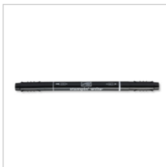
Basic Black Stampin' Write Marker