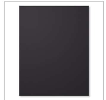
Basic Black 8-1/2" X 11" Cardstock