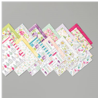
Best Dressed 6" X 6" (15.2 X 15.2 Cm) Designer Series Paper