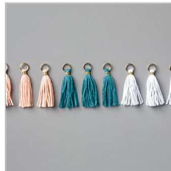
Best Dressed Tassels