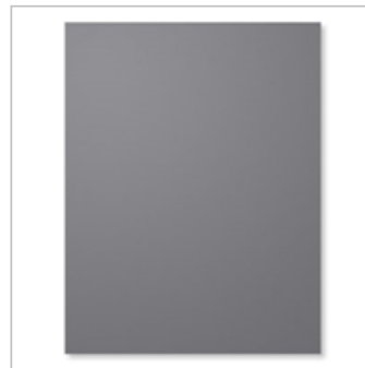
Basic Gray 8-1/2" X 11" Cardstock