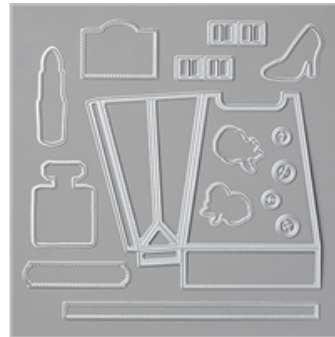
All Dressed Up Dies