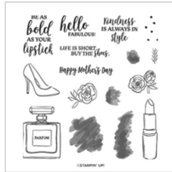
Dressed To Impress Photopolymer Stamp Set (English)