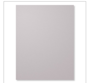
Smoky Slate 8-1/2" X 11" Cardstock