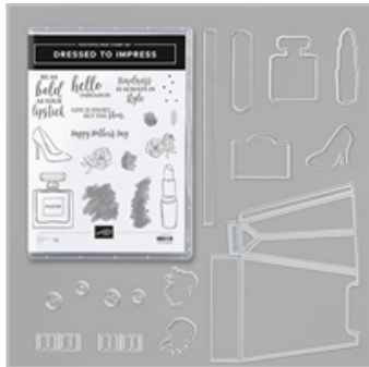
Dressed To Impress Bundle (English)