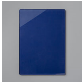
3D Embossing Folder Plate