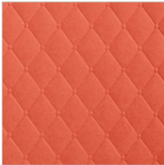
Tufted 3D Embossing Folder