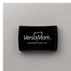
Versamark Pad - 102283