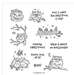
Stamp Set Cling Have A Hoot (English) - 153389