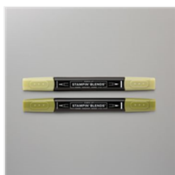
Old Olive Stampin' Blends Combo Pack - 154892