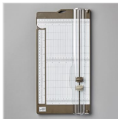
Paper Trimmer - 152392