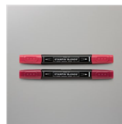
Cherry Cobbler Stampin' Blends Combo Pack - 154880