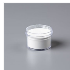
White Stampin' Emboss Powder - 109132