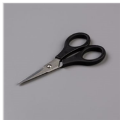
Paper Snips Scissors - 103579