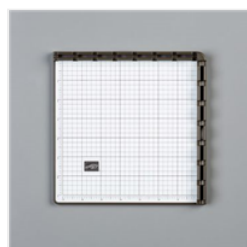
Stamparatus - 146276