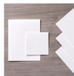
Whisper White 8- 1/2\"/>