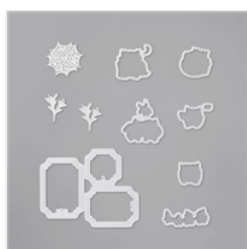
Peek-A-Hoot Dies - 153573