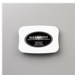
Tuxedo Black Memento Ink Pad - 132708