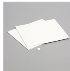
Mini Stampin' Dimensionals - 144108