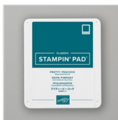
Pretty Peacock Classic Stampin' Pad - 150083