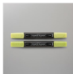
Granny Apple Green Stampin' Blends Combo Pack - 154885