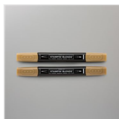
Soft Suede Stampin' Blends Combo Pack - 154906