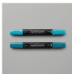
Pretty Peacock Stampin' Blends Combo Pack - 154895