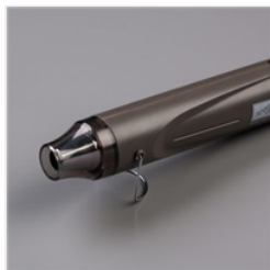
Heat Tool - 129053