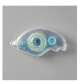
<u>Stampin' Seal -</u> <u>152813</u>