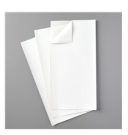
Adhesive Sheets - 152334