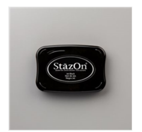
<u>Jet Black Stazon</u> <u>Pad - 101406</u>