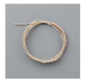
<u>Linen Thread -</u> <u>104199</u>

Stesha@stampinhoot.com https://stampinhoot.com/