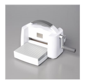
Stampin' Cut & Emboss Machine -149653