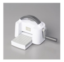
Mini Stampin' Cut & Emboss Machine - 150673