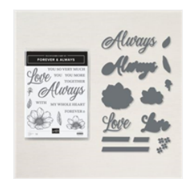
Forever And Always Bundle -156200

Stesha Bloodhart 715.497.6313 Stesha@stampinhoot.com https://stampinhoot.com/