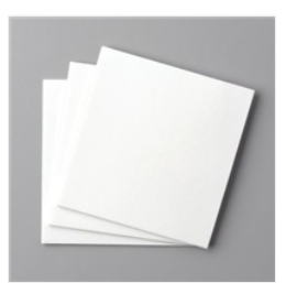
Foam Adhesive Sheets - 152815