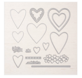
Stitched Be Mine Dies - 148527