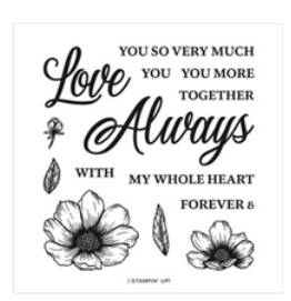
Forever & Always Photopolymer Stamp Set 154343