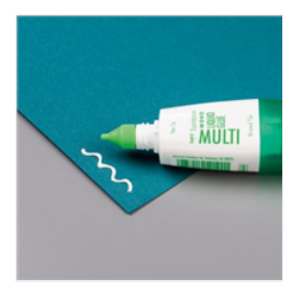
Multipurpose Liquid Glue -110755