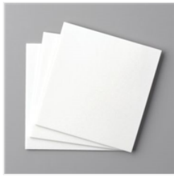
Foam Adhesive Sheets - 152815