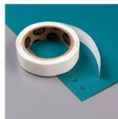
Glue Dots - 103683