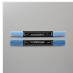
Night Of Navy Stampin' Blends Combo Pack - 154891