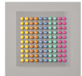
2020-2022 In Color Enamel Dots - 152480