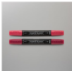
Cherry Cobbler Stampin' Blends Combo Pack - 154880