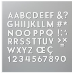
Playful Alphabet Dies - 152706