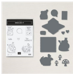
Snailed It Bundle (English) - 156255