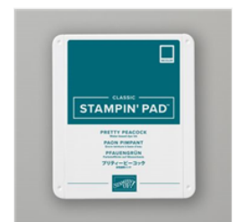
Pretty Peacock Classic Stampin' Pad - 150083