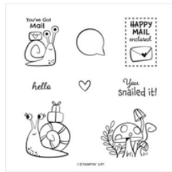
Snailed It Cling Stamp Set - 154472