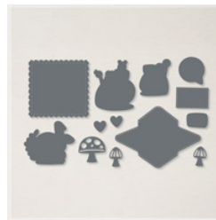
Snail Dies - 154327