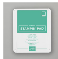
Just Jade Classic Stampin' Pad - 153115