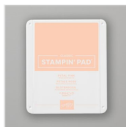
Petal Pink Classic Stampin' Pad - 147108