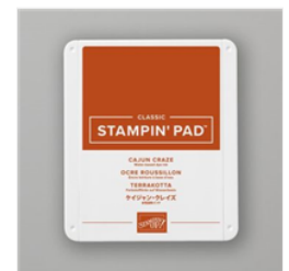
Cajun Craze Classic Stampin' Pad - 147085