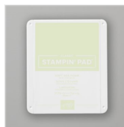
Soft Sea Foam Classic Stampin' Pad - 147102