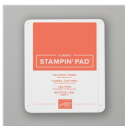
Calypso Coral Classic Stampin' Pad - 147101