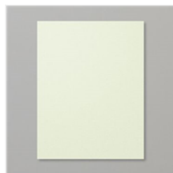
Soft Sea Foam 8- 1/2" X 11" Cardstock - 146988