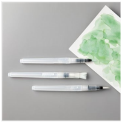
Water Painters - 151298

Stesha@stampinhoot.com https://stampinhoot.com/