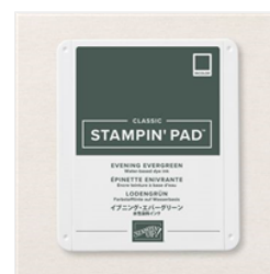
Evening Evergreen Classic Stampin' Pad - 155576