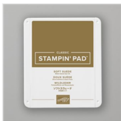
Soft Suede Classic Stampin' Pad - 147115