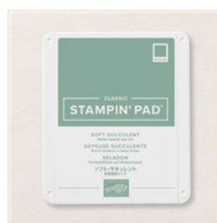
Soft Succulent Classic Stampin' Pad - 155778