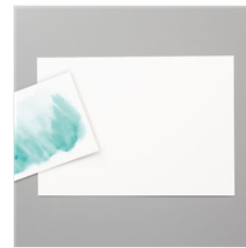
Fluid 100 Watercolor Paper - 149612