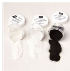
Basics Embossing Powders - 155554