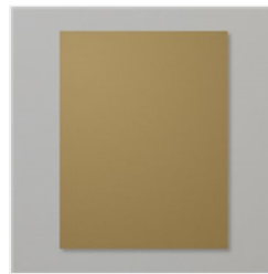
Soft Suede 8-1/2" X 11" Cardstock - 115318