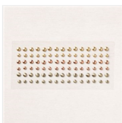
Brushed Metallic Adhesive Backed Dots - 156506