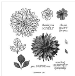
Delicate Dahlias Photopolymer Stamp Set (English) - 156601

Stesha@stampinhoot.com https://stampinhoot.com/