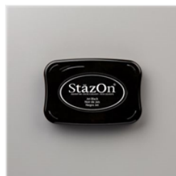
Jet Black Stazon Pad - 101406