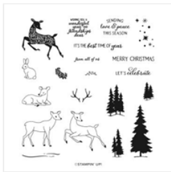
Peaceful Deer Photopolymer Stamp Set (English) - 156891