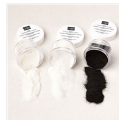
Basics Embossing Powders - 155554