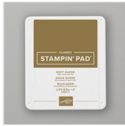
Soft Suede Classic Stampin' Pad - 147115