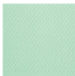
Tasteful Textile 3D Embossing Folder - 152718