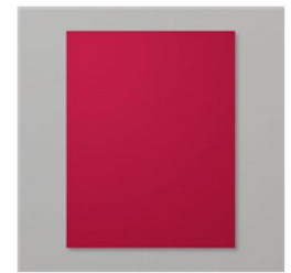
Cherry Cobbler 8- 1/2" X 11" Cardstock - 119685