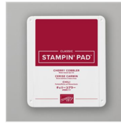
Cherry Cobbler Classic Stampin' Pad - 147083