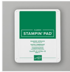
Shaded Spruce Classic Stampin' Pad - 147088