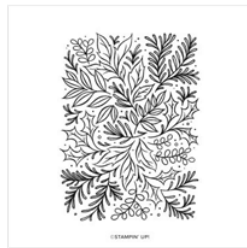
Festive Foliage Cling Stamp Set - 155634