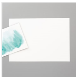
Fluid 100 Watercolor Paper - 149612