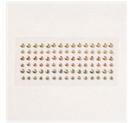
Brushed Metallic Adhesive Backed Dots - 156506