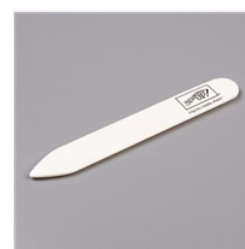
Bone Folder - 102300