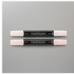
Petal Pink Stampin' Blends Combo Pack - 154893