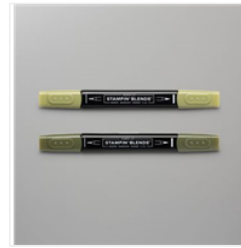
Mossy Meadow Stampin' Blends Combo Pack - 154890