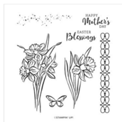
Daffodil Daydream Cling Stamp Set (English) - 157786