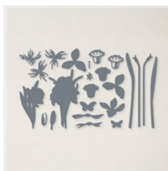
Daffodil Dies - 157794