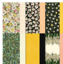
Daffodil Afternoon 12" X 12" (30.5 X 30.5 Cm) Designer Series Paper - 158127