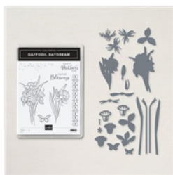
Daffodil Daydream Bundle - 157795

Stesha@stampinhoot.com https://stampinhoot.com/