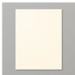
Very Vanilla 8-1/2" X 11" Cardstock - 101650