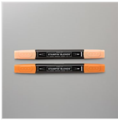
Pumpkin Pie Stampin' Blends Combo Pack - 154897

Stesha@stampinhoot.com https://stampinhoot.com/