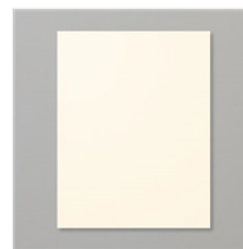
Very Vanilla 8-1/2" X 11" Thick Cardstock - 144237