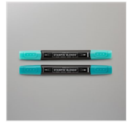
Bermuda Bay Stampin' Blends Combo Pack - 154878