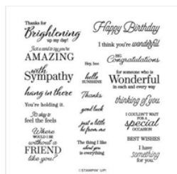
Special Moments Photopolymer Stamp Set (English) - 158081