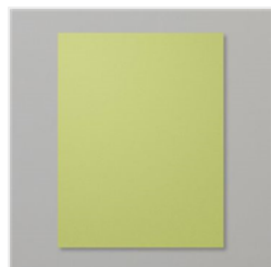
Pear Pizzazz 8-1/2" X 11" Cardstock - 131201