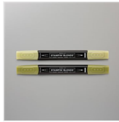
Old Olive Stampin' Blends Combo Pack - 154892