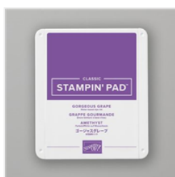
Gorgeous Grape Classic Stampin' Pad - 147099