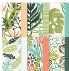
Artfully Composed 12" X 12" (30.5 X 30.5 Cm) Designer Series Paper - 157750