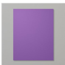
Gorgeous Grape 8-1/2" X 11" Cardstock - 146987