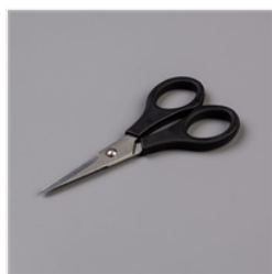
Paper Snips Scissors - 103579