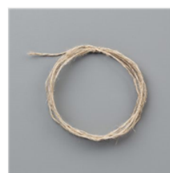
Linen Thread - 104199