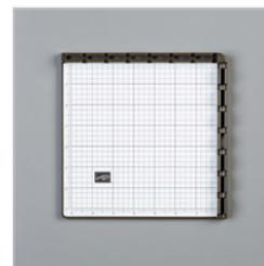
Stamparatus - 146276