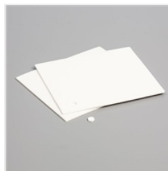
Mini Stampin' Dimensionals - 144108