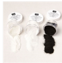
Basics Embossing Powders - 155554