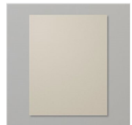
Sahara Sand 8- 1/2" X 11" Cardstock - 121043