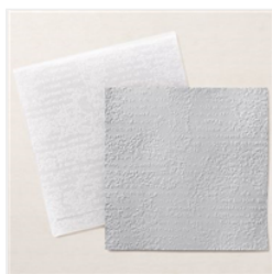
Timeworn Type 3D Embossing Folder - 156505