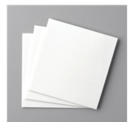
Foam Adhesive Sheets - 152815