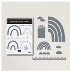
Rainbow Of Happiness Bundle (English) - 157727

Stesha@stampinhoot.com https://stampinhoot.com/