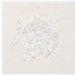
Sparkle & Shine Sequins Assortment - 158137