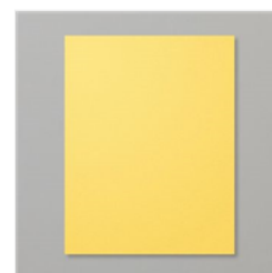
Daffodil Delight 8-1/2" X 11" Cardstock - 119683