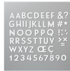
Playful Alphabet Dies - 152706