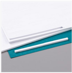
Foam Adhesive Strips - 141825

Stesha@stampinhoot.com https://stampinhoot.com/