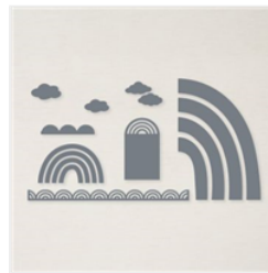
Brilliant Rainbow Dies - 157726