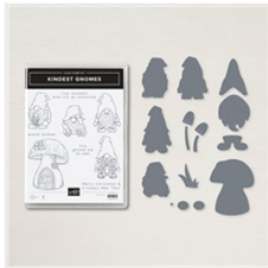
Kindest Gnomes Bundle (English) - 159626

Stesha@stampinhoot.com https://stampinhoot.com/