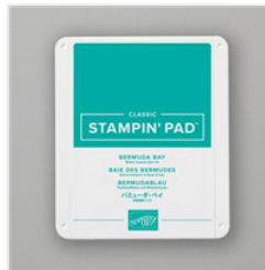
Bermuda Bay Classic Stampin' Pad - 147096