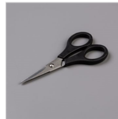
Paper Snips Scissors - 103579