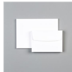
Basic White Note Cards & Envelopes - 159232