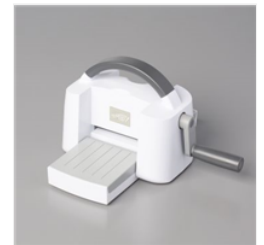
Mini Stampin' Cut & Emboss Machine - 150673