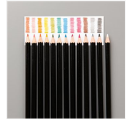
Watercolor Pencils - 141709