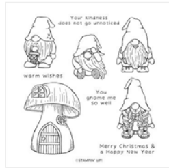
Kindest Gnomes Cling Stamp Set (English) - 159616