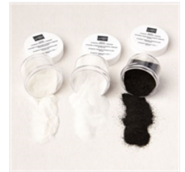
Basics Embossing Powders - 155554