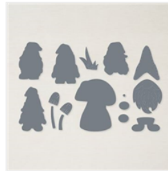
Gnomes Dies - 159625