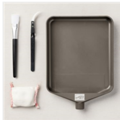
Embossing Additions Tool Kit - 159971