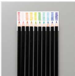
Watercolor Pencils Assortment 2 - 149014