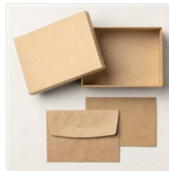
Kraft Note Cards & Envelopes - 159247