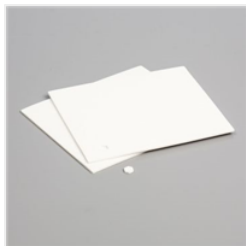
Mini Stampin' Dimensionals - 144108