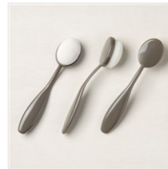
Blending Brushes - 153611