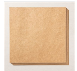
Kraft 6" X 6" (15.2 X 15.2 Cm) Paper Pack - 156325