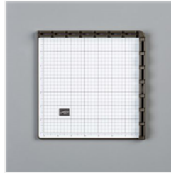
Stamparatus - 146276