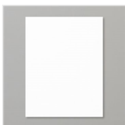
Basic White 8-1/2" X 11" Thick Cardstock - 159229