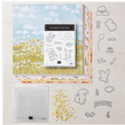
Rain Or Shine Suite Collection (English) - 160556

Stesha@stampinhoot.com https://stampinhoot.com/