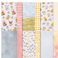
Rain Or Shine Specialty 12" X 12" (30.5 X 30.5 Cm) Designer Series Paper - 160540