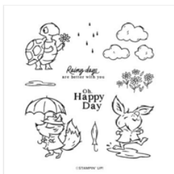
Playing In The Rain Cling Stamp Set (English) - 160542