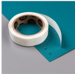
Mini Glue Dots - 103683