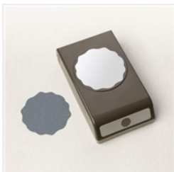
Decorative Circle Punch - 159174