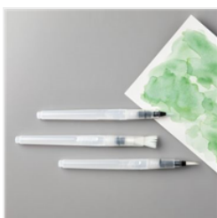
Water Painters - 151298