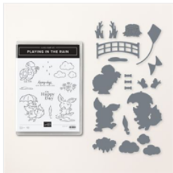
Playing In The Rain Bundle (English) - 160551