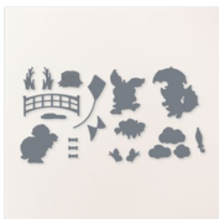
Playing In The Rain Dies - 160550