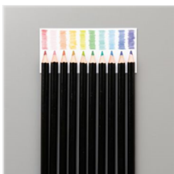
Watercolor Pencils Assortment 2 - 149014