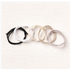
Baker's Twine Essentials Pack - 155475