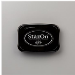
Jet Black Stazon Pad - 101406