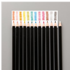
Watercolor Pencils - 141709