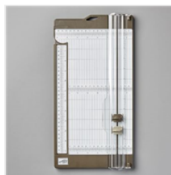
Paper Trimmer - 152392