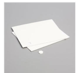
Stampin' Dimensionals - 104430