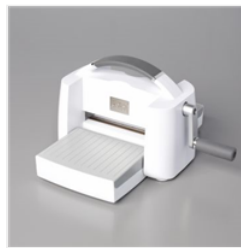
Stampin' Cut & Emboss Machine - 149653