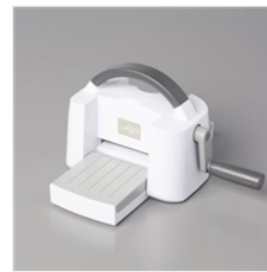
Mini Stampin' Cut & Emboss Machine - 150673