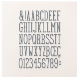
Alphabet à La Mode Dies - 160750