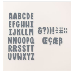
Mini Alphabet Dies - 162934