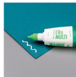
Multipurpose Liquid Glue - 110755