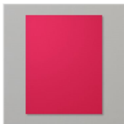
Real Red 8-1/2" X 11" Cardstock - 102482