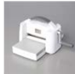
Stampin' Cut & Emboss Machine - 149653