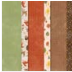
Sweet Days Of Autumn 12" X 12" (30.5 X 30.5 Cm) Designer Series Paper - 166498