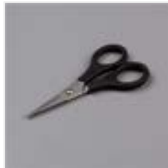
Paper Snips Scissors - 103579