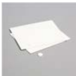
Stampin' Dimensionals - 104430