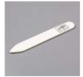
Bone Folder - 102300