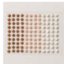
Adhesive-Backed Swirl Dots - 163464