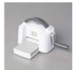
Mini Stampin' Cut & Emboss Machine - 150673