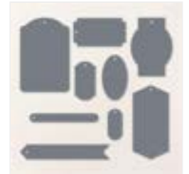
Greetings Of The Season Dies - 164112