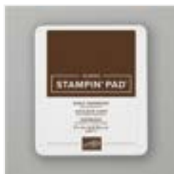
Early Espresso Classic Stampin' Pad - 147114