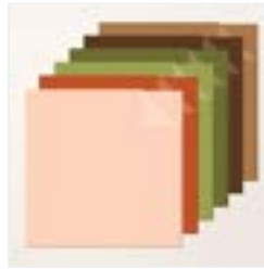
Autumn To Remember 12" X 12" (30.5 X 30.5 Cm) Two-Tone Cardstock - 166499