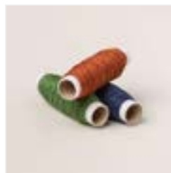
Natural Tones Linen Thread - 164071