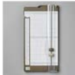
Paper Trimmer - 152392