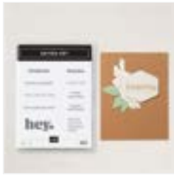
Saying Hey Photopolymer Stamp Set (English) - 163697

Stesha@stampinhoot.com https://stampinhoot.com/