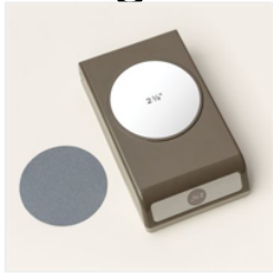
2-3/8" (6 Cm) Circle Punch - 161354