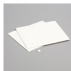
Mini Stampin' Dimensionals - 144108