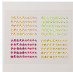
Adhesive-Backed Shiny Sequins - 163484