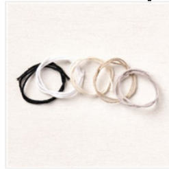
Baker's Twine Essentials Pack - 155475