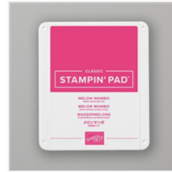
Melon Mambo Classic Stampin' Pad - 147051