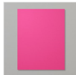
Melon Mambo 8-1/2" X 11" Cardstock - 115320