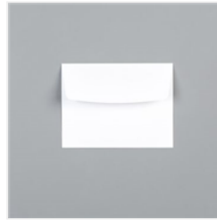
Basic White Medium Envelopes - 159236