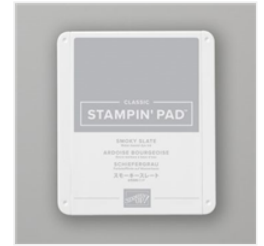
Smoky Slate Classic Stampin' Pad - 147113