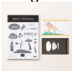
Terrific Toadstools Bundle (English) - 164790