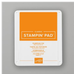
Pumpkin Pie Classic Stampin' Pad - 147086