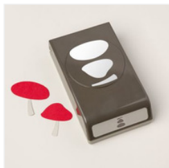
Terrific Toadstools Builder Punch - 164789