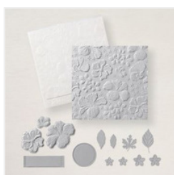
Happy Hibiscus Hybrid Embossing Folder - 164879