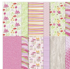
Toadstool Gardens 6" X 6" (15.2 X 15.2 Cm) Designer Series Paper - 164942